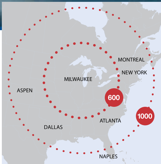
King Air B200 Flight Range in NM